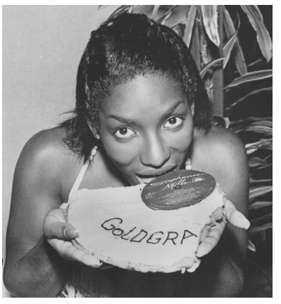
Stephanie Mills eating cookie replica of her gold record, 1981.

View these collections and more at: http://webapp1.dlib.indiana.edu/ images/splash.htm?scope=aaamc.