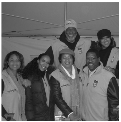
WHUR staff at Food 2 Feed.