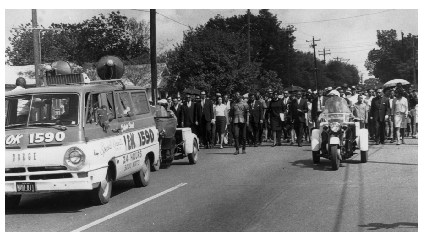
KYOK van in front of civil rights marchers in Houston, Texas, 1967.

grab listeners' attention to both the songs they played and commercial products they promoted. Many Black radio deejays became celebrities to their listening audiences, with star-power that sometimes eclipsed the artists they promoted on the air. Audio and video clips in the exhibit recount how Black radio was the only place recordings by Black artists could be heard outside of the record store and home, and how deejays were often responsible for promoting songs and "breaking the hits."