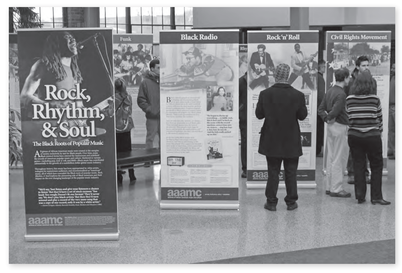
Reception for Rock, Rhythm, & Soul at the Bloomington City Hall Atrium on Jan. 15, 2009.