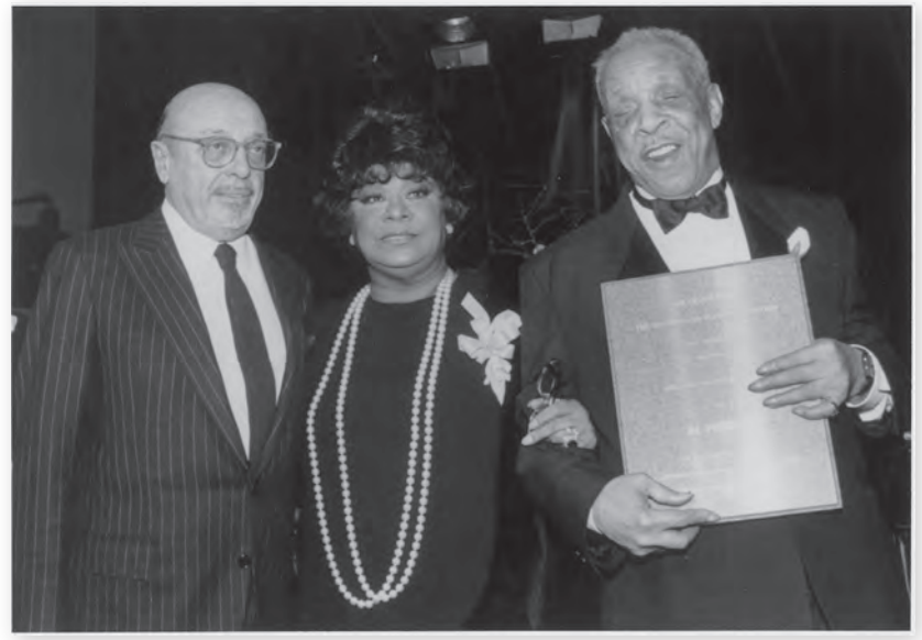
Above: Photograph of Ahmet Ertegun, Ruth Brown, and Al Hibbler. AAAMC General Photo Collection Below: Photograph of Ray Charles, 1930. SC 93: Jock Hickman Collection

Drawing heavily on the best practices and preservation methods established by IU's Archives of Traditional Music during its NEH-funded Sound Directions project, Pioneers of Rhythm & Blues will support the preservation of two of the AAAMC's collections. The Portia Maultsby Collection includes in-depth interviews conducted from 1981–1986. Maultsby's interviews trace the emergence of black music divisions and the promotion of black artists by major record labels—topics that have not yet been adequately explored. Maultsby recorded interviews with one